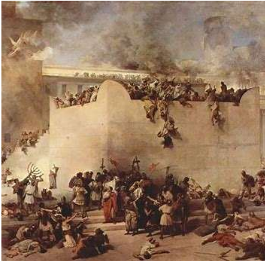
Destruction of the Temple of Jerusalem - Painting by Francesco Hayez - Fine Art America Antisemitism - ADL.ORG