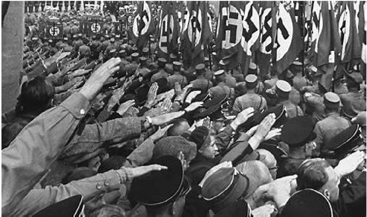
Origins of Neo-Nazi and White Supremacist Terms and Symbols – United States Holocaust Memorial